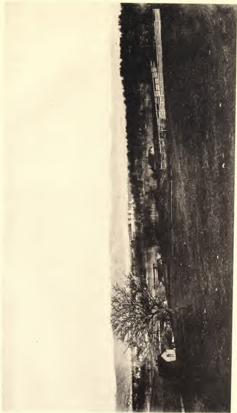
MISSION RIDGE BATTLE FIELD.